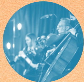
ASH WEDNESDAY February 22