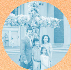
EASTER SUNDAY April 9