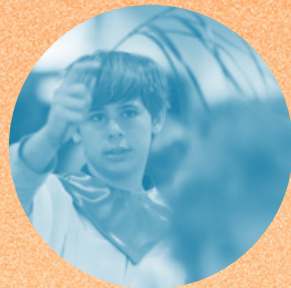
PALM SUNDAY April 2